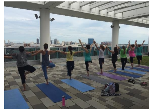
Eskenazi Health, 5-Star AchieveWell Organization

We help communities develop comprehensive quality of life initiatives and unite around the desire to create better places for our citizens to live, learn, work, and play with our Indiana Healthy Community initiative .