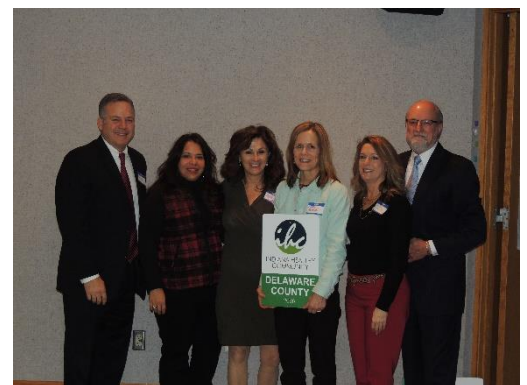
Delaware County 2016 Designated Indiana Healthy Community